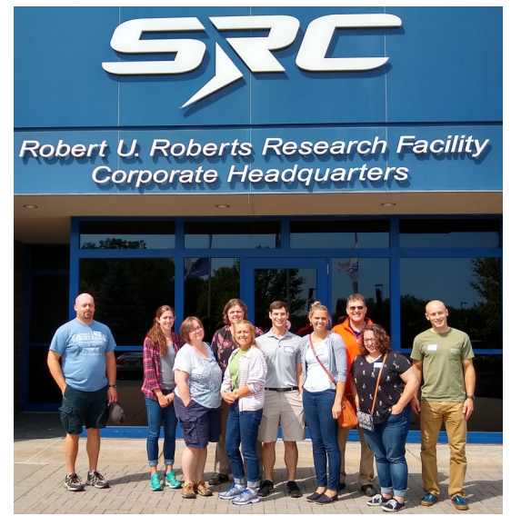
Fig 1: The group after the visit to SRC.

This year, we aimed to provide a broad set of experiences. On the morning of the first day, we visited a local company, Syracuse Research Corporation (SRC) that employs many people in STEM fields. Teachers saw the ways that students with a physics background could apply their talents in industry (see Fig. 1). In the afternoon, we had a series of presentations on astrophysics and soft matter research at Syracuse, followed by laboratory tours (see Fig. 2).