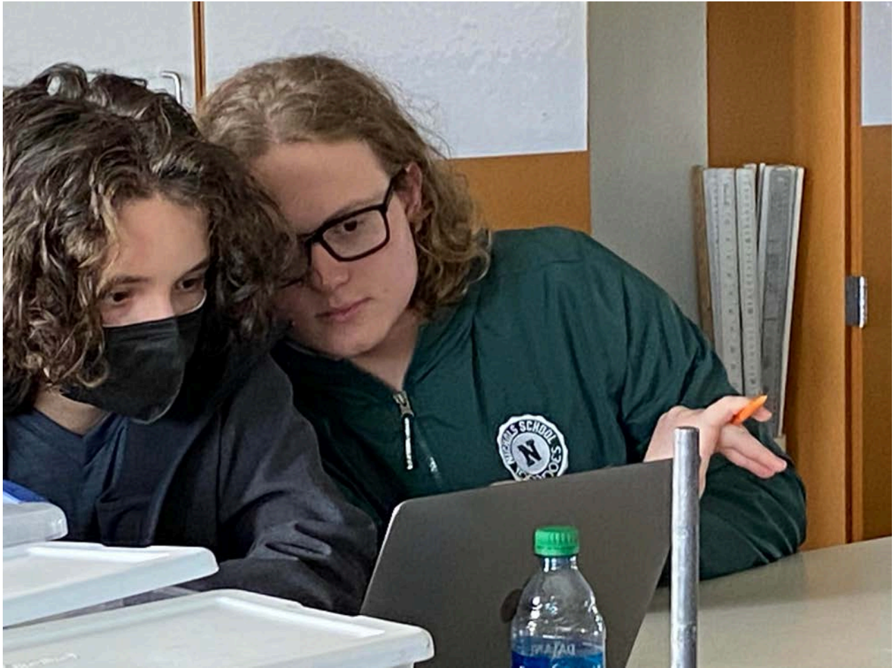
Photo: QuarkNet Masterclass at Nichols High School, 04/01/2022. Nichols High School students analyzing the CMS/LHC data.