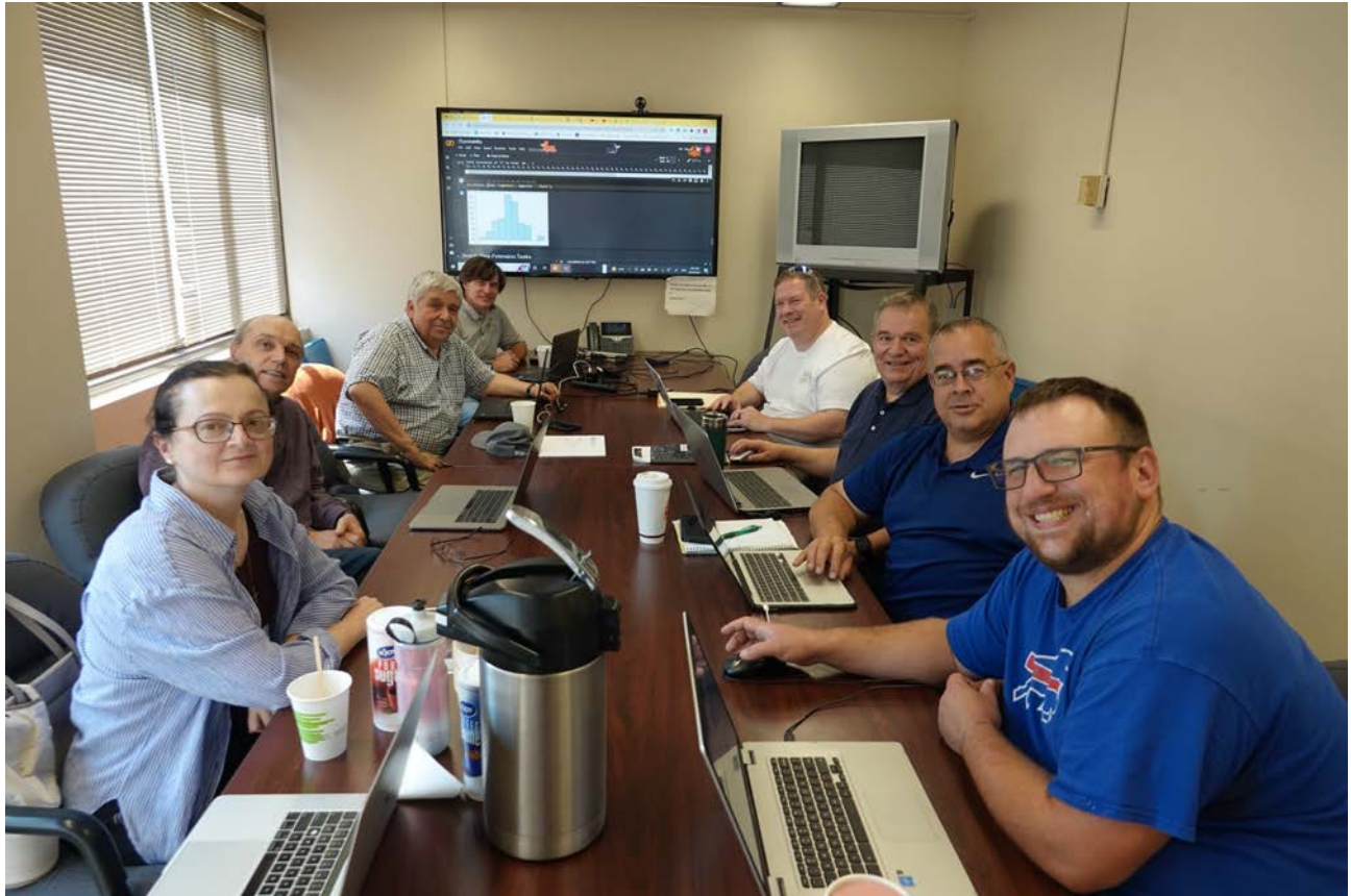
Photo: Summer 22 QuarkNet Workshop at the UB Physics Department, 08/22-08/24/22. The Workshop participants analyzing mass histograms produced with Jupyter Notebook and using CMS open data.