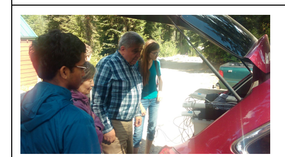
Cosmic flux in Guye Cabin in Snoqualmie