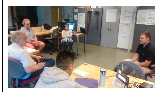
August LIGO e-Lab