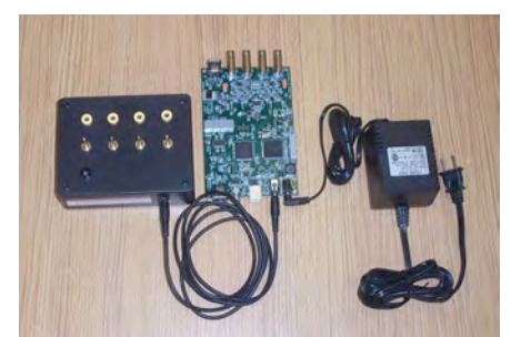
2. DAQ female jack ←→ PDU (single, side outlet): 6 ft. PDU power cable, male mono connectors