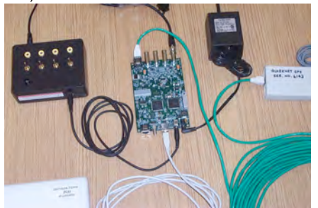
6. DAQ → computer USB port: USB 2.0 A to B cable