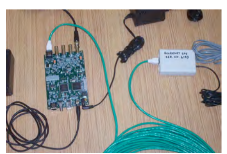
5a. GPS antenna → GPS Receiver Assembly: black MCX cable 5b. temp sensor → GPS Receiver Assembly: gray phone cable, red sensor end 5c. GPS Receiver Assembly → DAQ: CAT-5 green network cable Note: CAT-5 cable plugs into DAQ "GPS IN", not "GPS FANOUT".