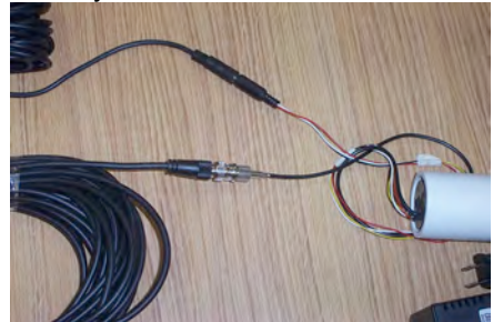
4. PMTs/counters BNC connections (4) ←→ DAQ BNC connections: 50 ft. BNC signal ext cables