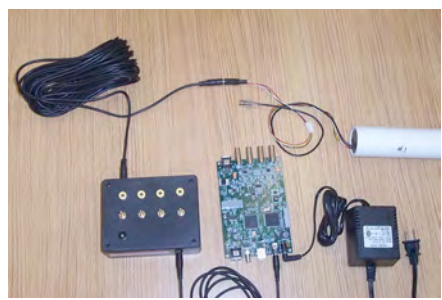
3. PMTs/counters (4) ←→ PDU (four, side outlets): 50 ft. power extension cable, stereo connectors

Note: check all power connections; must be fully seated.