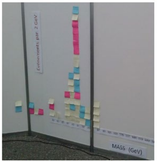
Mass plot of Z candidates.

For the <u>W analysis</u>, the W is charged; therefore, it can only create one charged decay product thus conserving charge. Students identify W candidates as those with only one muon or antimuon track. The decay also creates a neutrino; this conserves momentum. The neutrino is not directly detected. To find if the possible W particle is a W^+ or a W^- , students use the curvature of the muon (or antimuon) track. A track with clockwise curvature indicates the positive charge carried by the antimuon after its decay from the W^+ . An anticlockwise curvature indicates the presence of a muon decaying from the W^- . Students count and report the number of W^+ and W^- candidates. The total number of W^+ candidates divided by the total number of W^- candidates in the class yields a W^+ to W^- ratio. Students ignore the mass of these events.